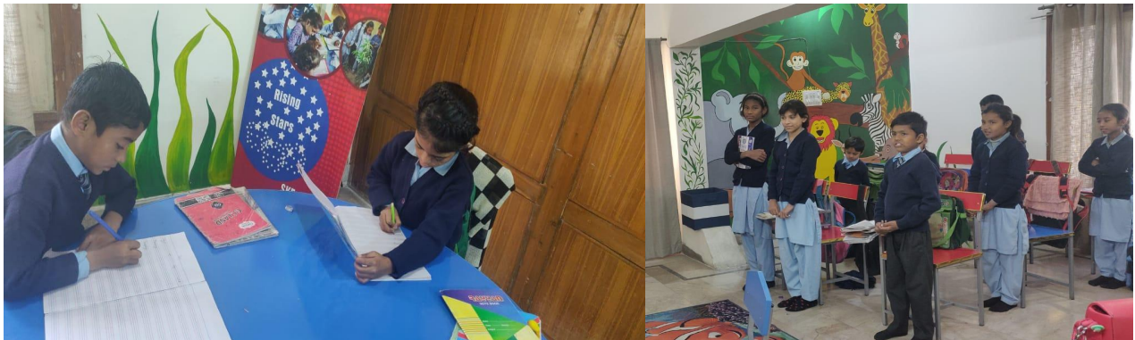
Children in classrooms at the SKF's Learning Center

To date there are 12 SKF Raising Star Scholarship students that have successfully transitioned from the SKF Learning Center and receive regular education in different public & private local primary schools.