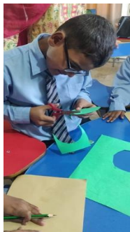
Children learning about shapes and using their imaginations to draw, design & create